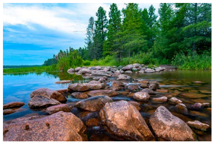
Headwaters of the Mississippi River at Itasca State Park.

The Mississippi River watershed covers more than 37% of the continental United States (2,981,076 km<sup>2</sup>). The river itself provides drinking water for over 18 million people and passes through 10 states. The source of the "Mighty Mississippi" begins as a meager creek in Lake Itasca, Minnesota, but the river grows as it flows, all the way to the Mississippi River delta in Louisiana and its final destination in the Gulf of Mexico.