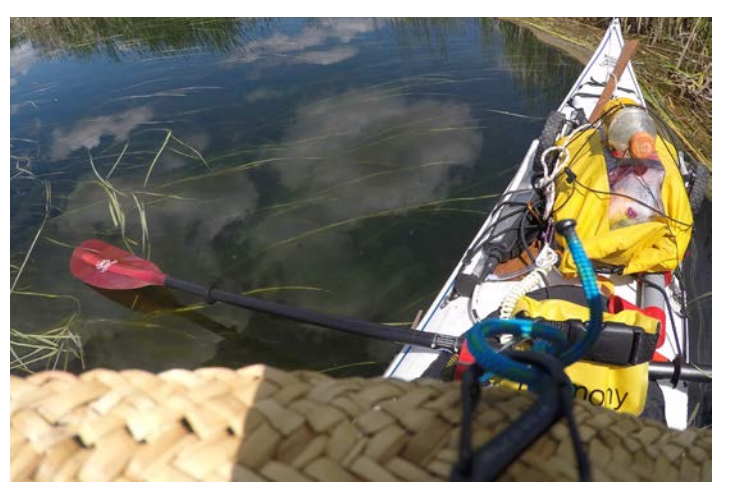
Pohl's view during her trip down the Mississippi River.

Total Dissolved Solids and Specific Conductance Data Graphs (figure 1) for specific conductance (mS/cm) and total dissolved solids (TDS) (g/L) generally show the trend one would expect: at or near zero at the source and a huge spike upon reaching the Gulf of Mexico. At the confluence of fresh water with salt water, the specific conductance spiked to 8.42 mS/cm and TDS spiked to 5.47 g/L in the Gulf. There is a noticeable spike and drop (samples 62 and 70) which correspond with the Twin Cities, Minnesota, and Lake Pepin, respectively. The spikes of samples 115 and 117 correspond with the confluence of the Illinois and Missouri Rivers, respectively, while the drop at sample 131 corresponds with the confluence of the Ohio River. Another factor that could alter these measurements include municipal discharge (salt from human waste, water softeners, detergents, and minerals could significantly increase conductivity). -continued-